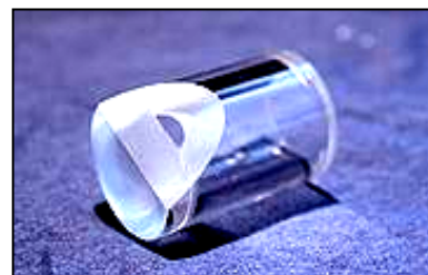
Duran glass O2k-Chamber

The O2k-Chambers are made of Duran glass and are closed by PVDF or PEEK stoppers which are as diffusion tight as titanium. The magnetic stirrer bars are coated by PVDF or PEEK. Teflon is avoided due to high oxygen solubility ( Gnaiger 1995 ). Viton O-rings are used for sealing the stoppers. Butyl rubber gaskets provide the seals for the oxygen sensors. These sealing materials minimize oxygen diffusion into or out of the experimental chambers.